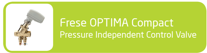
Frese OPTIMA Compact Pressure Independent Control Valve